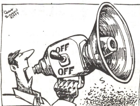
FREE SPEECH IN THE WORKPLACE

Any cheques should be made payable to Anti - Fascist Action and sent to this address :-